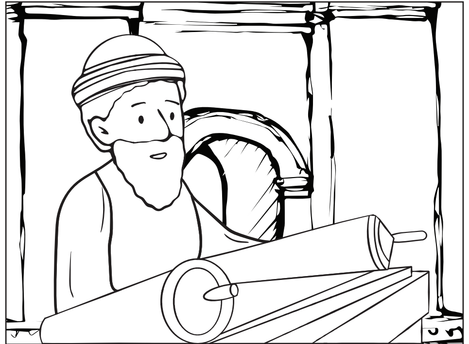
Ezra Reads the Law

PEOPLE LAW LISTENED LEVITES TOGETHER JOY PRAISED HOLY EZRA READ NEHEMIAH ASSEMBLY